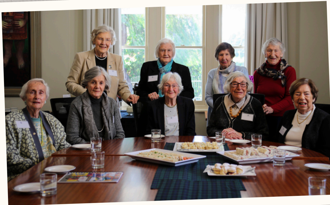
70 Year Reunion (Class of 1947) Scorgie House Boardroom.