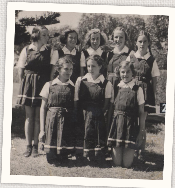
1939 Under-14 Relay Team, this photo appeared in the 1939 Kookaburra